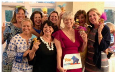
Classmates from MI '81 get together.