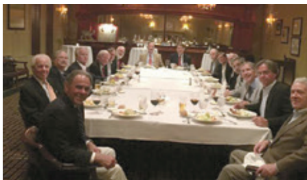
Members of CDS '70 gather during Reunion Weekend.