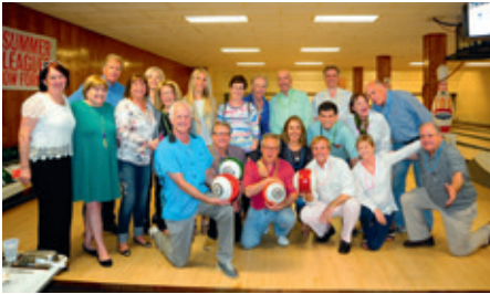
CDS and MI Classes of 1973 came together for an evening of bowling during Reunion Weekend.