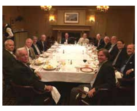
Classmates from CDS' 70 gather at the Racquet Club of St. Louis.