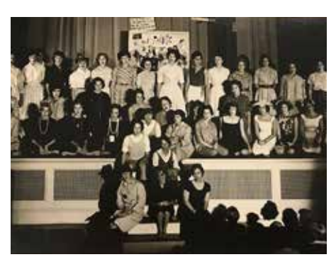
Senior Day, Mary Institute, 1960