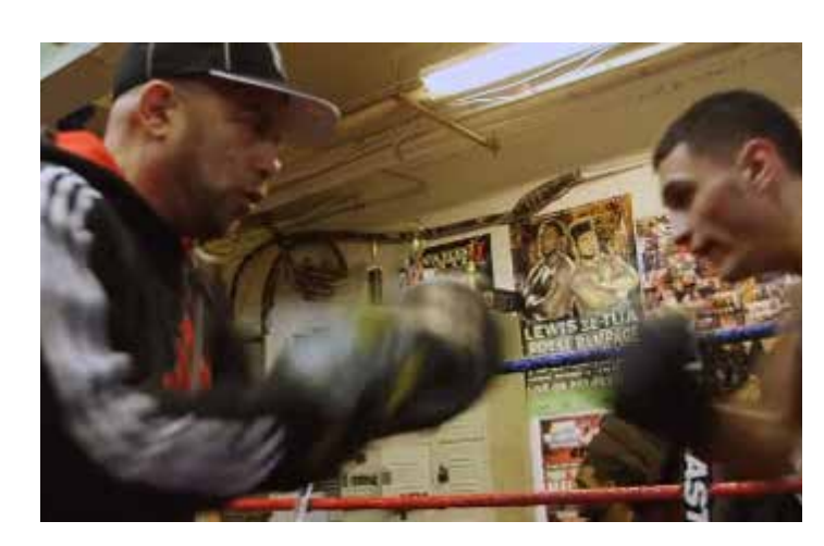
A still from a scene in Donald Rosenfeld's film, "Cradle of Champions," which screened at the St. Louis International Film Festival in November.

Donald Rosenfeld '81 recently produced the documentary film "Cradle of Champions," which screened at the St. Louis International Film Festival and also won "Best Documentary" at the Big Sky Film Festival in Montana. "Cradle of Champions" captures the epic story of three young people fighting for their lives in the oldest, biggest and most important amateur boxing tournament in the world: the New York's Daily News Golden Gloves. "Cradle of Champions" follows three inspiring individuals on an urban odyssey through the 10-week Golden Gloves. The film had complete access to the tournament — for the first time in its 90-year history — and to its